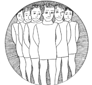
the bodies stood up - a great army

This prophecy has recently been fulfilled. For nearly two thousand years the Jews have been scattered in every nation of the world. God has been working in recent history to fulfil this prophecy which He gave to Ezekiel so many hundreds of years ago. In the Second World War Nazi Germany persecuted the Jews. Hitler ordered several million Jews to be killed. After the war people were horrified by this persecution of the Jews. The Jews were given the land of Israel as their homeland. In 1948 the Jews became a nation again in their own land. Thousands of Jews returned to live in the land. Today Israel is a nation, living in its own land with a strong army.