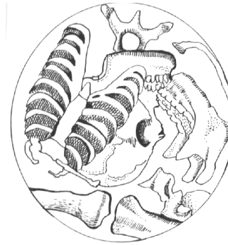
a valley full of dry bones

In a vision Ezekiel saw a valley with dead bones scattered about. The bones were very dry. There did not seem to be any hope that these bones could ever come to life again. This was like the nation of Israel (the Jews) after it was scattered in AD 70. They were no longer a nation.